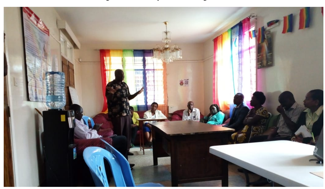
Breakfast meeting Kisumu county health management team