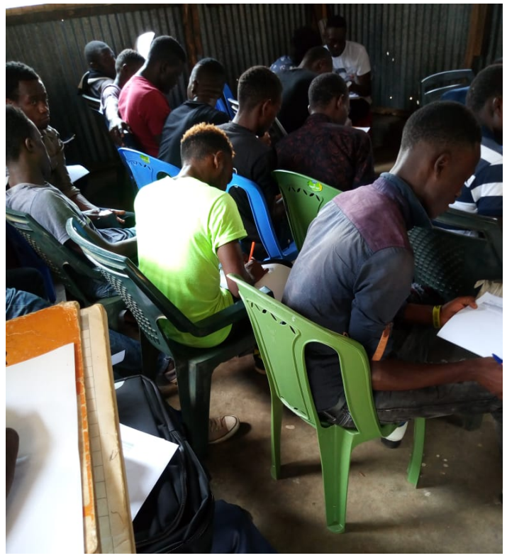
Focus group discussion session; where honest opinions are expressed freely