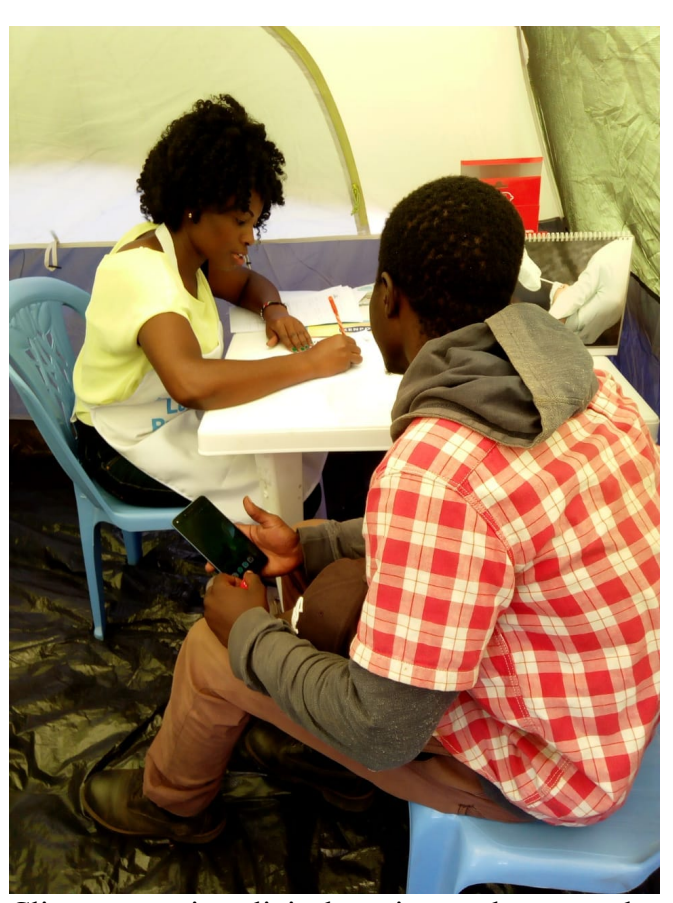
Clients accessing clinical services at the outreach